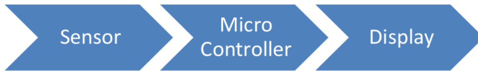
Figure 1. Sytem architecture for monitoring