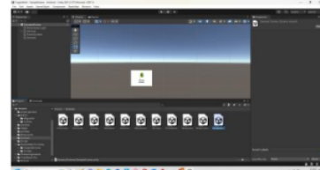
Figure 3 Creating augmented reality applications using unity

In Figure 2, 3d creation using the blender application, the mode using cubes first, then shaping to resemble red ginger, then adding red color to make it more similar. Add a motif to make it look more like red ginger in the real world.