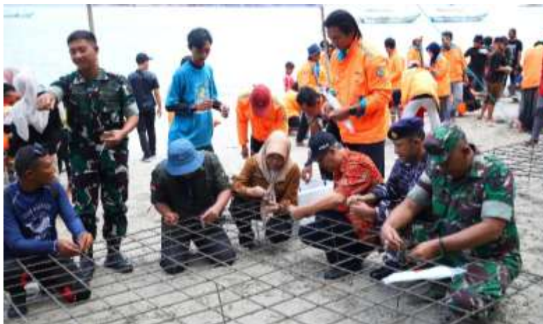
Figure 2. Demonstration of coral fragment attachment techniques

The initiative utilized the Community-Based Participatory Research (CBPR) approach. This framework emphasizes active involvement and tangible contributions from all participants, grounded in the community's desire to address environmental challenges such as declining fish catches, increasing water turbidity, and massive coastal abrasion. This approach ensured that local stakeholders were partners in the research and restoration process rather than just passive recipients. The study utilized direct participatory observation and technical performance evaluation during the demonstration phase (see Figure 2). Environmental literacy was measured by the participants' ability to successfully replicate the demonstrated techniques—specifically the correct handling of Acropora fragments and the secure application of cable ties to the iron racks without damaging the coral tissue.