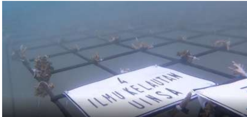
Figure 3. Transplanted coral racks

The selection of the Acropora genus was a strategic scientific choice based on its relatively rapid growth rate [13, 14], which is essential for accelerating the recovery of reef structural complexity in high-traffic tourism zones. While long-term growth percentages require multi-year monitoring, the successful deployment of 3,800 fragments provides the necessary biological foundation (T-0 baseline) for increased coral cover and reef fish biodiversity. The final underwater installation was a collaborative effort between the Mutiara Dive Center, Pokmaswas Rembeng Raya, and Marine Science students. This specialized team ensured that the 12 racks were positioned safely and stably on the seabed to serve as a T-0 baseline for the site's new status as a "Field Laboratory" for continuous environmental monitoring. Figure 3 is explicitly defined as the T-0 baseline documentation, representing the initial state of the restoration site before the first monthly growth cycle.