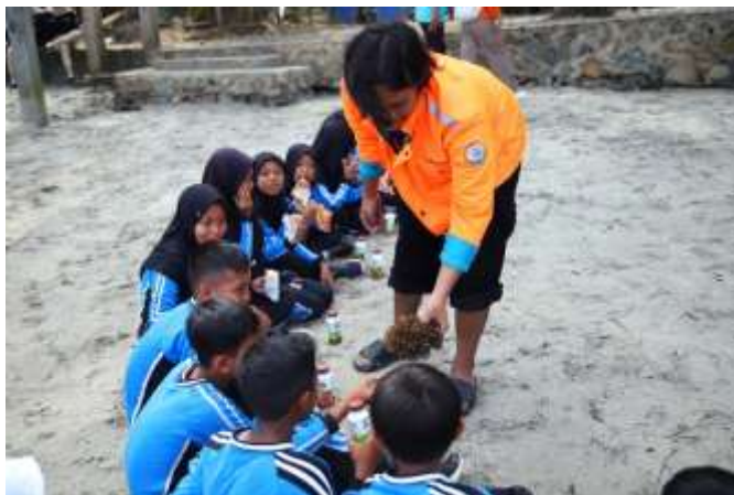
Figure 4. Knowledge Transfer