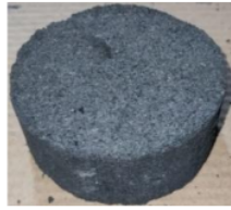
Figure 2. Processed Wood Waste Briquettes with Natural Adhesive (Starch)