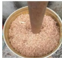
Figure 1. Raw material for briquettes from processed wood waste

Figure 1 as seen in the figure above is the wood waste raw material used as the main ingredient in briquette processing in this research. The wood waste was collected from one of the MSMEs in the wood processing industry in Kampar Regency. The wood waste that was collected and then used as raw material for processing briquettes in this research was 2 kg or the equivalent of 0.002 m 3 .