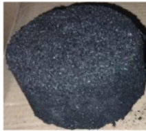
Figure 3. Processed Wood Waste Briquettes with Synthetic Rubber Adhesive