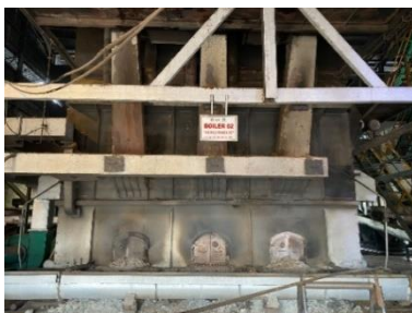
Figure 2. Boiler

Carbonization is defined as the combustion process of converting an organic substance into carbon or carbon-containing residue in the combustion process to produce charcoal, liquid, and gas. This burning is carried out at a temperature of 270°C according to the biomass to be carbonized, namely fiber and shell. If the biomass is dense, the temperature required is higher, and vice versa, and uses sufficient air in a closed room. In this carbonization process, the biomass is touched by fire directly in the boiler combustion furnace. In a boiler combustion furnace, two forms of solid waste will be produced, namely boiler ash and fly ash. The waste used to make briquettes is boiler ash waste. It can be seen in Figure 2, namely the boiler.