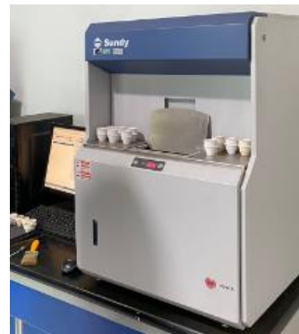
Figure 4. Testing the Calorific Value of Bio-Briquettes

The experimental results from a 1 kg sample can produce 11 pieces of bio-briquettes weighing 100 grams per piece. If the combustion potential in the boiler furnace per day is 7,536 tons, it can produce 82,896 pieces of bio-briquettes weighing 100 grams per piece. If the potential for boiler ash waste in the palm oil factory environment of PT. ADEI PLANTATION & INDUSTRY reaches 188.4 tons per month, it can produce 2,072,400 pieces of bio-briquettes weighing 100 grams. The annual potential for boiler ash reaches 2,261 tons, so it can produce 24,871,000 pieces of bio-briquettes weighing 100 grams.